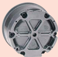
Back view for surface mounting.