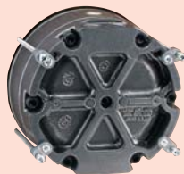
Back view shows flush mounting adapters.