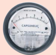
Flush mounted in panel.

Capsuhelic® gages may be flush mounted in a panel or surface mounted. Hardware is included for either. For flush mounting, a 4 1/8" diameter cutout in panel is required. Where high shock or vibration are problems, order optional A-496 Heavy Duty flush mount bracket. Optional A-610 kit provides simple means of attaching gage to 1/4"-2" horizontal or vertical pipe. Installation is same as Magnehelic® gage shown on page 4. All standard models are calibrated for vertical mounting. Gages with ranges above 5 in. w.c. can be factory calibrated for horizontal or inclined mounting on special order.