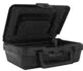
Protective Carrying Case