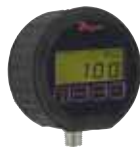
DPG-100 with Protective Rubber Boot