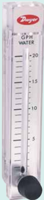
Model RMB-SSV 5" scale, 8 3/8" high