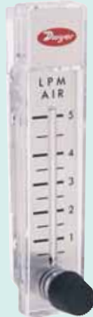
Model RMA-SSV 2" scale, 4 1/8" high