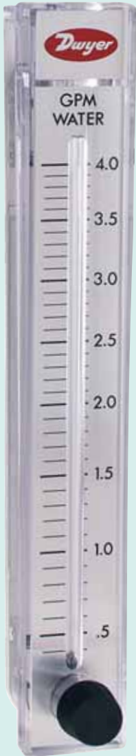
Model RMC-SSV10" scale, 15 3/8" high