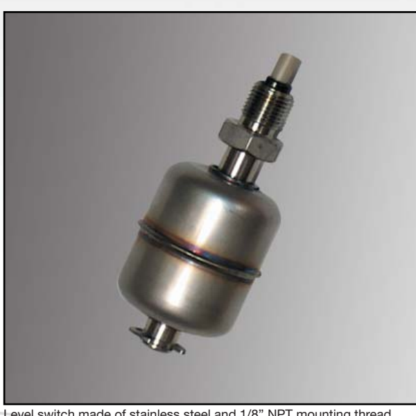
Level switch made of stainless steel and 1/8" NPT mounting thread