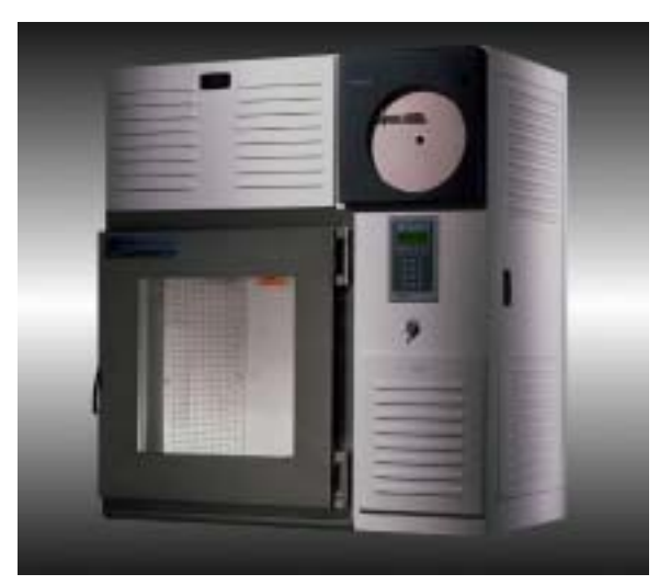
Pictured with optional window and chart recorder

The interior chamber is constructed of very durable, corrosion resistant 316 stainless steel. Low watt density heaters are used that also contribute to the unit's longer life.